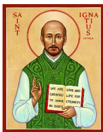
FEAST DAY- 31 JULY